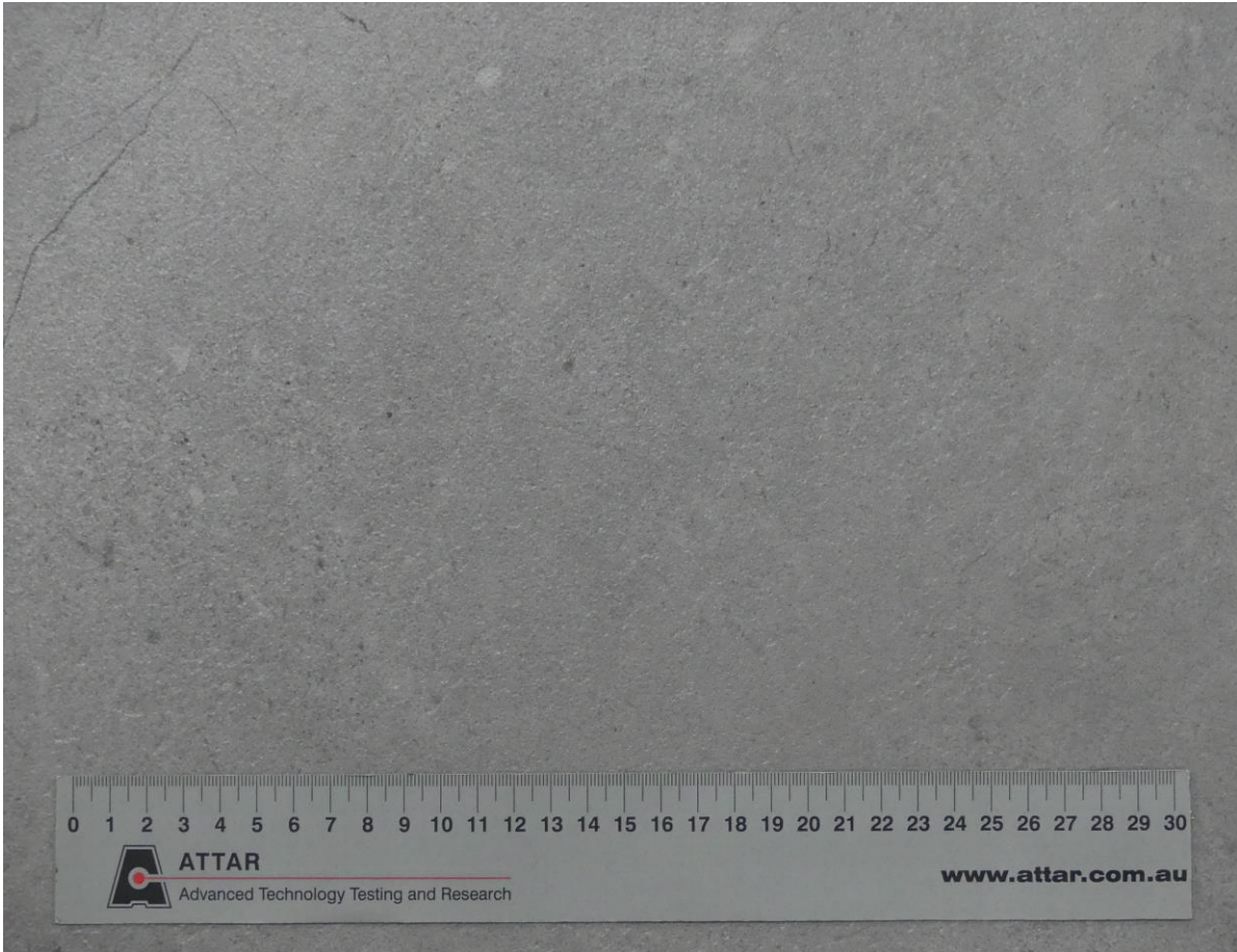
Figure 1: Virtuo Stone 55